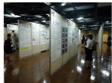
Fig.2 Poster Session Image